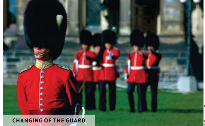
CHANGING OF THE GUARD