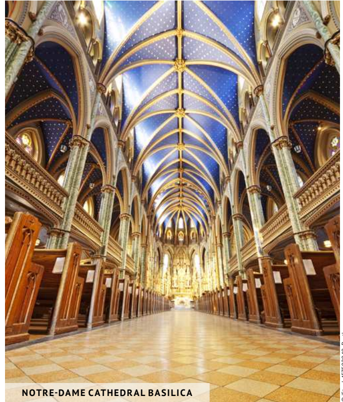
NOTRE-DAME CATHEDRAL BASILICA