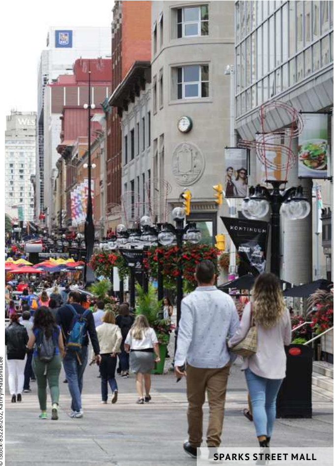
SPARKS STREET MALL

This magnificent Neo-Gothic style cathedral was designated a National Historic Site of Canada in 1990 because of its great heritage value. The building's notable features include its stone exterior, its two square towers, an ornately decorated interior with vaulted ceilings and extensive woodwork, and its interior sculptures carved by notable Canadian sculptor, Philippe Hebert. Visits are not permitted during mass hours. NOTREDAMEOTTAWA.COM